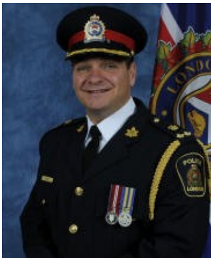
Class of 1980