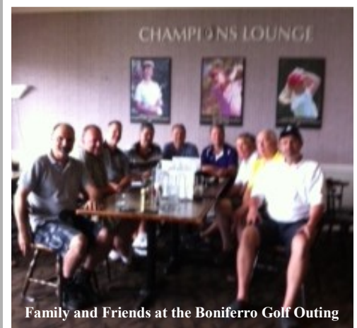
Family and Friends at the Boniferro Golf Outing

Approximately $600 was raised for charity, Big Brothers and Sisters. See you next year. Everyone is welcome.